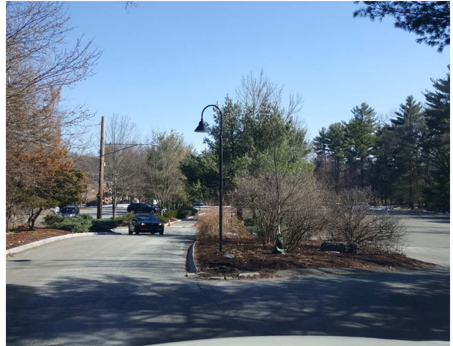
Temple Beth Avodah