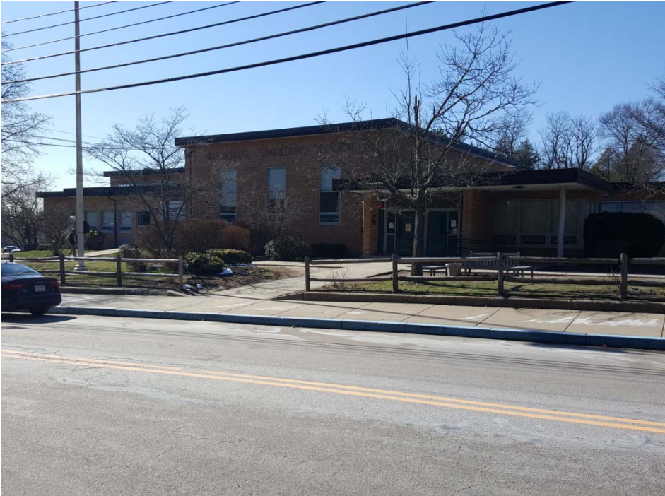
Memorial Spaulding School